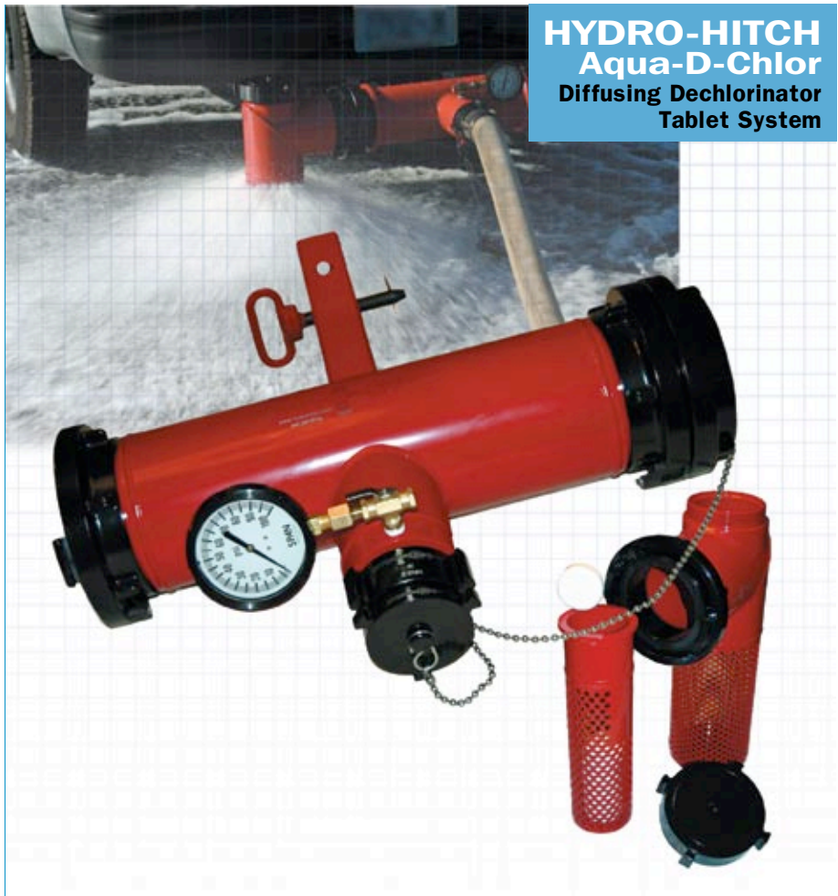
HYDRO-HITCH Aqua-D-Chlor Diffusing Dechlorinator Tablet System